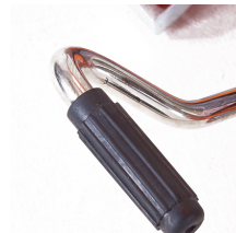
Manually operated via pump action foot pedal